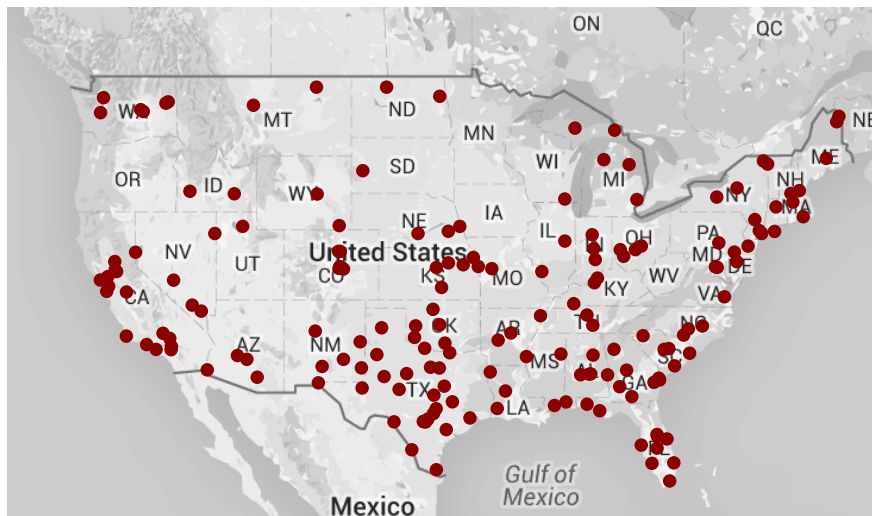
Figure 1 Plot of geographic locations of ports in the continental United States.